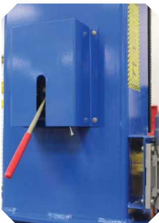
Single Point Release Handle