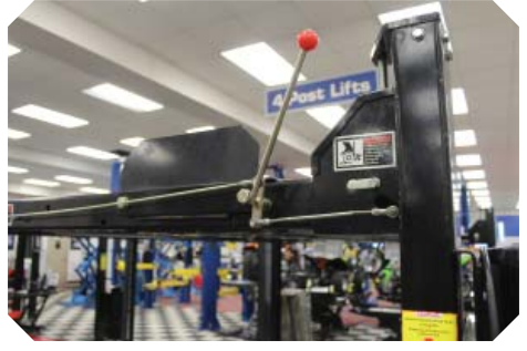
Mechanical Lock Release Handle