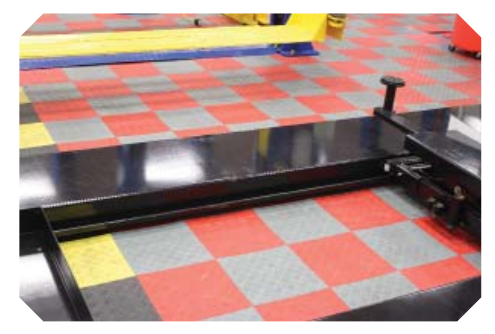
Resting On The Ground