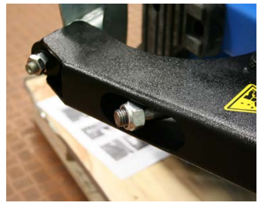
STEP 8: Use the locking handle to lock the hex shaft into place. Remove the bolt and cap from the top of the hex shaft. Set the cap and bolt nearby.